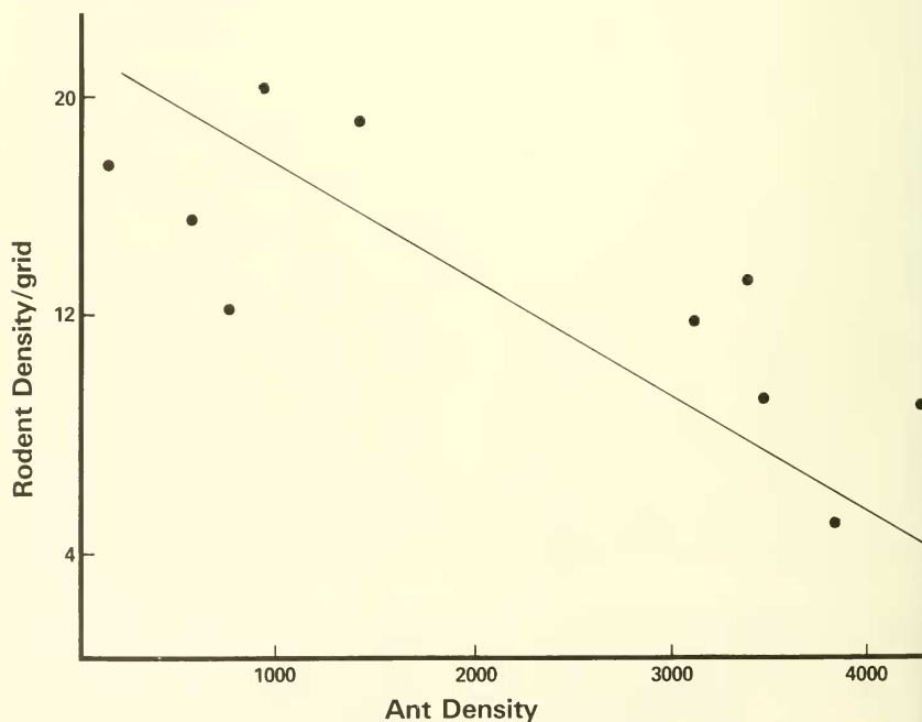
Fig. 2. The correlation between ant and rodent density ( p < 0.025 ) is shown for May–August 1978.